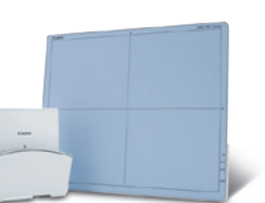
CXDI-70C Wireless Premium Flat-Panel Detector

The lightweight and compact detector offers exceptional digital radiographic imagery, large area detection, and a detachable cable for time-effective transport and simple installation.